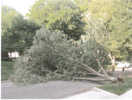
A 45-50 year old Linden tree blocking the entire street of Greenway Terrace

Brookside was among many neighborhoods to experience violent winds that toppled decades-old trees during the past few weeks this spring. Contact 311 Action Center for the three areas of tree drop offs.